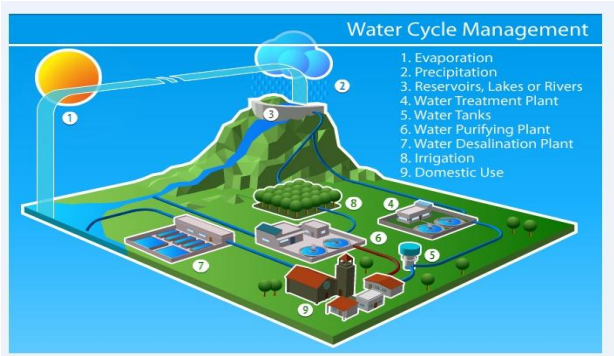
Fig. 3 water level indicator