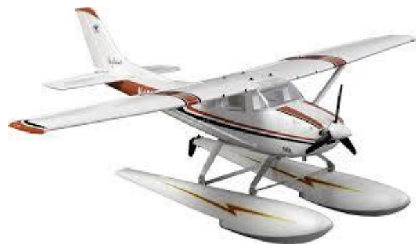
Fig. 5 sea plane as an amphibian robot